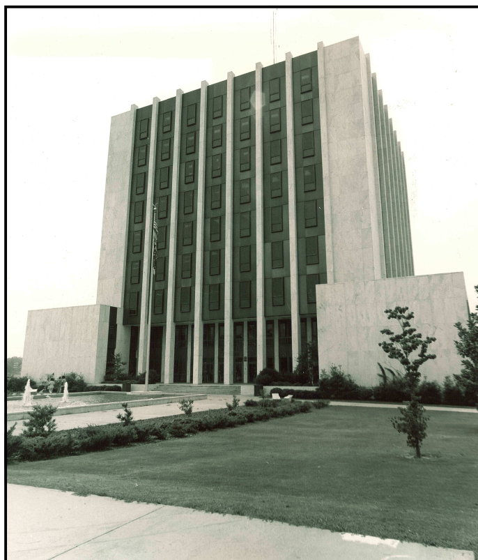
The DeKalb County Courthouse is located at 556 N. McDonough Street, Decatur GA 30030.