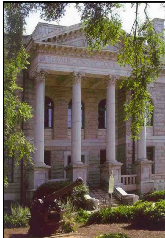
The DeKalb History Center is in the historic DeKalb County Courthouse, which is located at the intersection of Clairemont and E. Ponce de Leon. 101 E. Court Square, Decatur, GA 30030.

To receive this document electronically, email archives@dekalbhistory.org or call 404-373-1088, extension 23. You can print a copy from your computer. Visit our website at www.dekalbhistory.org and click on the Newsletter tab and scroll down to Special Publications.