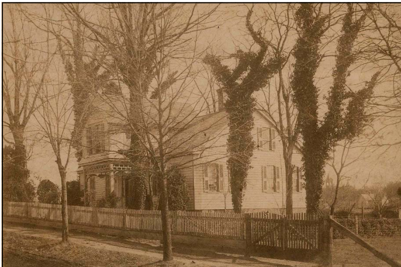
The Swanton House around 1890. It is seen here at its original location in downtown Decatur—240 Atlanta Avenue.

The house was enlarged and updated periodically, each change reflecting the current popular trends. Over the course of about 100 years, the original pioneer cabin was transformed into a Georgian cottage, which is defined by its floor plan of a central hallway with two rooms on either side. Around 1890, the house was embellished with an Eastlake style porch