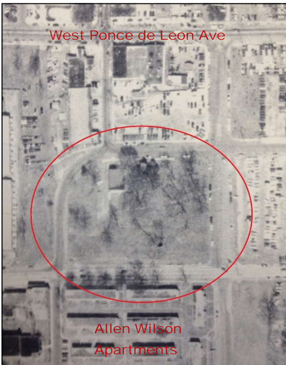
An aerial view of the Swanton House in 1970 shows the reconfigured streets before the house was moved.

The second part of this article will appear in the summer issue of the Times of DeKalb . ✦